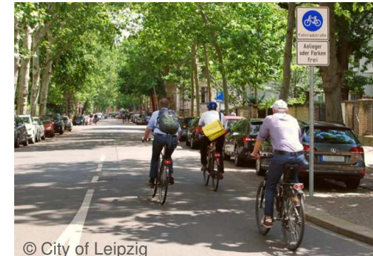
Implementing bicycle roads