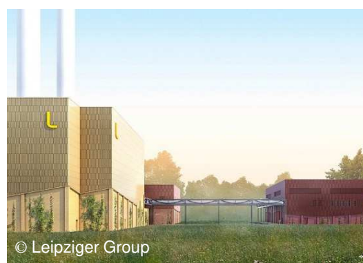
Clean energy supply (H2 ready)