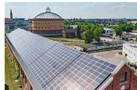
Expansion of renewable energies within the city area and the region