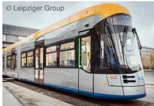
Efficient public transport