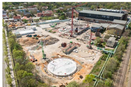
Reducing fossil dependency by transforming district heating